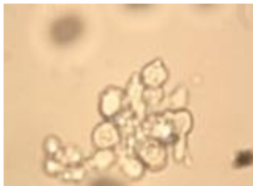
Fig. 2 Cells obtained from suspension culture of cotyledon calluses.